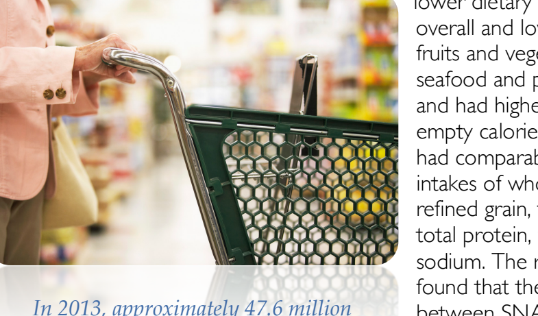
In 2013, approximately 47.6 million individuals, or about one in seven Americans, participated in SNAP.

lower dietary quality scores overall and lower scores for fruits and vegetables, seafood and plant proteins, and had higher intake of empty calories. The groups had comparable scores on intakes of whole grains, refined grain, total dairy, total protein, fatty acid, and sodium. The researchers found that the relationship between SNAP participation and lower dietary quality was primarily observed in women, Hispanics, young