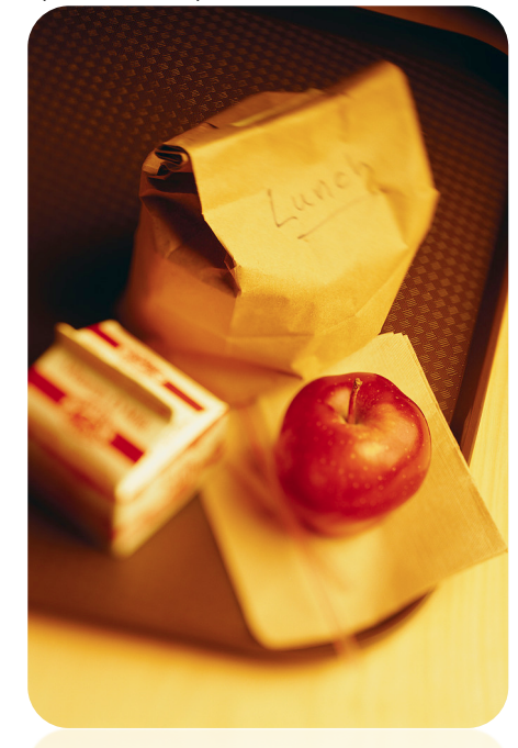
Studies on packed lunches report that children who bring their lunch tend to consume fewer fruits and vegetables, less fiber and more total calories than those who participate in the National School Lunch Program

The findings highlight the challenges associated with packing healthful items to send to school. "When deciding what to pack, parents are juggling time, cost, convenience, and what is acceptable to their children. Unfortunately, these factors are not always in harmony with good