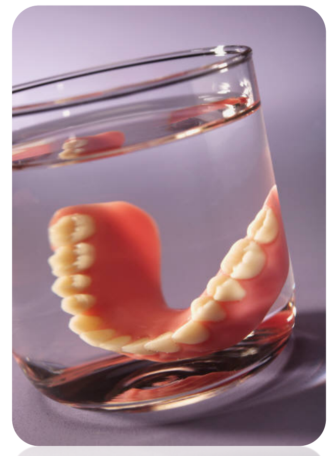
Difficulty eating, commonly caused by denture problems, was one the more common explanations for malnutrition among seniors.

symptoms of depression (52 percent), those residing in assisted living (50 percent), those with difficulty eating (38 percent) and those reporting difficulty buying groceries (33 percent). Difficulty eating was mostly attributed to denture problems, dental pain or difficulty swallowing.