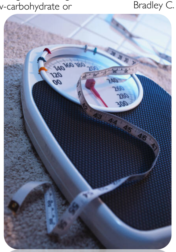
There was very little difference in weight loss in either the short or the long term between the different branded weight loss programs.

carbohydrate diets had a median difference in