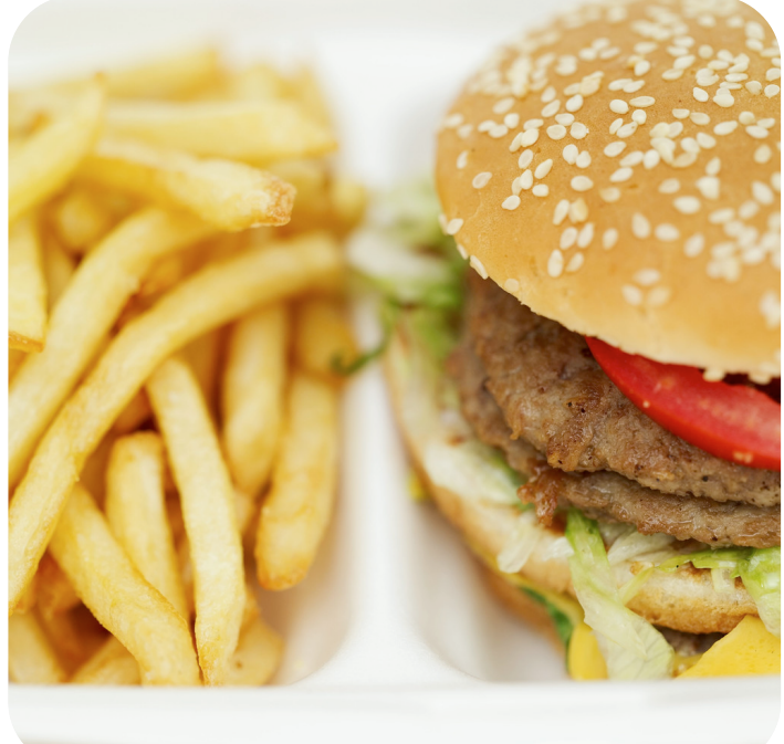
An isolated change in the school environment isn't likely to have an impact on its own, particularly when students still have access to high-fat, high-calorie foods from other sources.