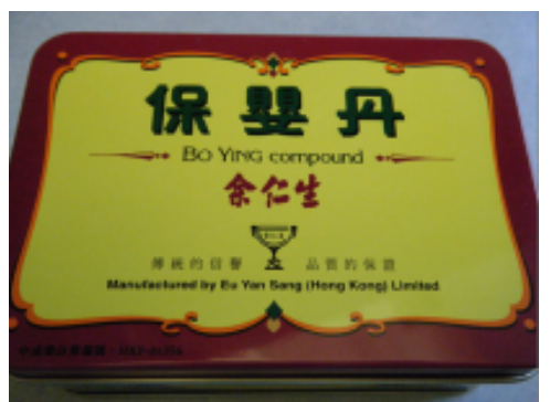
The powdered product is marketed in retail outlets and online for use in infants and children.

Health care professionals and consumers are encouraged to report to FDA any adverse events