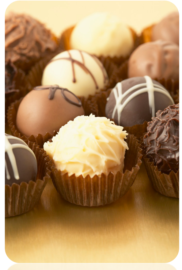
There's currently very little evidence to support the idea that any ingredient, food item, additive, or combination of ingredients has addictive properties.

Utrecht and Santiago de Compostela. The researchers are involved in the NeuroFAST consortium, which is an EU-funded project studying the neurobiology of eating behavior, addiction and stress.