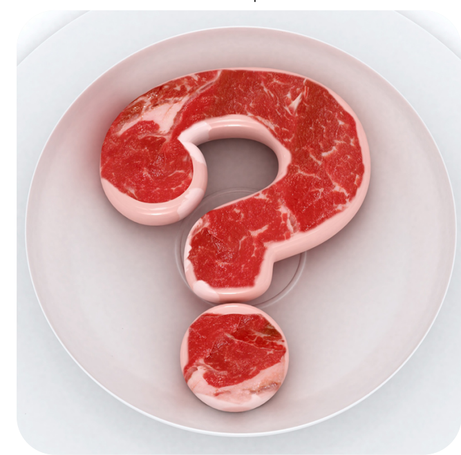
A panel of state regulators and food safety practitioners assessed 10 popular cooking shows, with two to six episodes per show watched for a total of 39 episodes.

Although the assessment showed many issues regarding food safety on television cooking shows, room for improvement was easily identified by the researchers. For instance, steps toward improvement could include requiring food safety