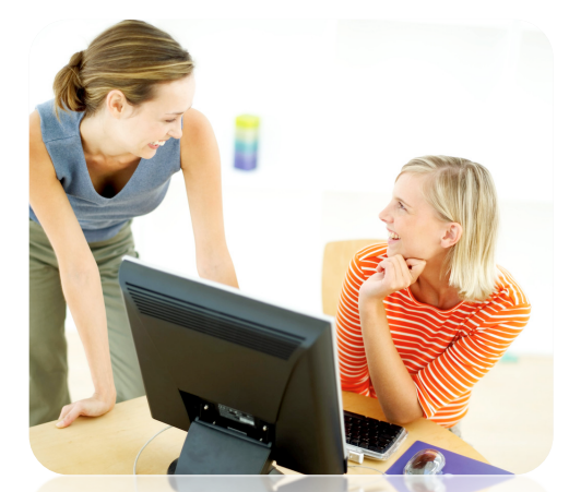
The campaign's strategy includes clearly focused, positive, and realistic messages, written in plain language.