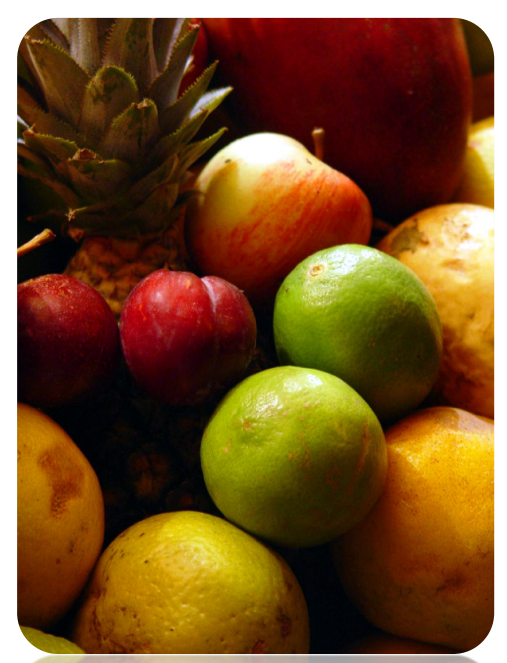
The recipes developed by the Food Hero project are healthy, costeffective, and many are kidapproved.

Parents and caregivers are also surveyed after their children participate in tasting exercises. Of those who completed surveys, 79 percent said their child talked about what they had learned in school about healthy eating; 69 percent reported that their child asked for specific recipes; and 72 percent