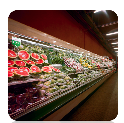
For an establishment to be eligible as a SNAP retailer, they must now offer a minimum of 84 foods.

"This final rule balances the need to improve the healthy staple foods available for purchase at participating stores, while maintaining food access for SNAP recipients in underserved rural and urban areas," said Vilsack. "We received many helpful comments on the proposed rule and have modified the final rule in important ways to ensure that these dual goals are met. I am confident that this rule will ensure the retailers that participate in SNAP offer a variety of healthy foods for purchase and that SNAP recipients will continue to have access to the stores they need to be able to purchase food."