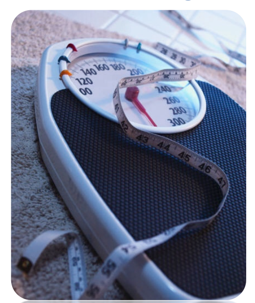
More research is needed to determine if similar results occur in men or women with type 2 diabetes.

tissue, but the total difference was only about a pound. We question whether there's a significant clinical benefit to such a small difference."