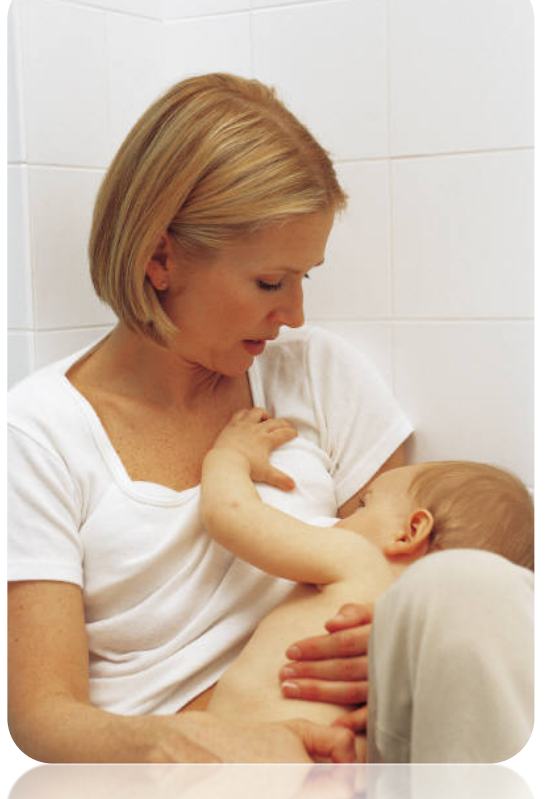
"There is convincing evidence that breastfeeding provides substantial health benefits for children and adequate evidence that breastfeeding provides moderate health benefits for women."

informed choice about how to feed their infants and to be successful in their choice. Interventions include promoting the benefits of breastfeeding, providing practical advice and direct support on how to breastfeed, and providing psychological support. Interventions can be categorized as professional support, peer support, and formal education, although none of these categories are mutually exclusive, and interventions may be combined within and between categories. Interventions may also involve a woman's partner, other family members, and friends.