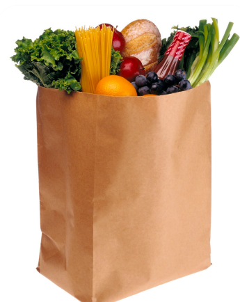
Stores that primarily sell snack foods are not able to participate in SNAP.

retailer volunteers for a two-year, nationwide pilot to enable SNAP participants to purchase their groceries online. USDA also provided funding to incentivize participants in SNAP to purchase more healthy fruits and vegetables through the Food Insecurity Nutrition Incentive Program, increased farmers market participation in SNAP to improve access to fresh and nutritious food, and announced a purchase and delivery pilot, which is designed for non-profits and government entities to improve access to groceries solely for homebound elderly and disabled SNAP participants.