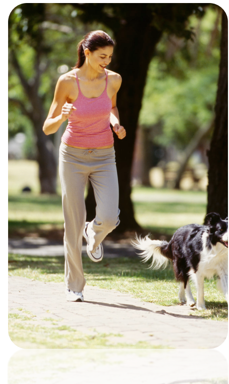
Current physical activity guidelines suggest that aerobic activity should be accumulated in bouts of at least 10 minutes in duration.

be looking for specific markers that predispose people to higher risks for certain conditions. The physical activity and sleep data we collect from wearable devices will be used to track compliance to individualized behavior prescriptions while attempting to optimize each individual's health."