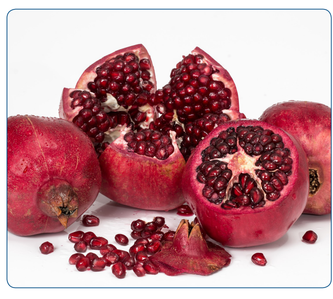
Pomegranates contain ellagic acid, which has anti-inflammatory properties.

Past studies have shown that diets with higher amounts of pomegranate can improve overall health. Pomegranates have ellagic acid,