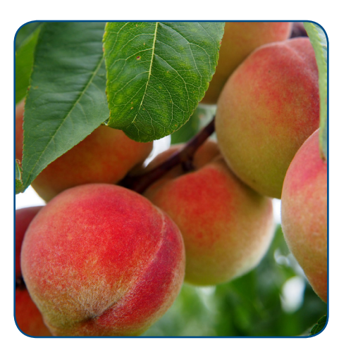
Those with an allergy to birch pollen are more likely to react to peaches, plums, apricots, and other similar fruits.

that as many as 47-70 percent of patients with a pollen allergy have OAS. Like a traditional food allergy, OAS is caused by the immune system reacting to a compound in the food, known as an antigen. This involves a specific part of the immune system, known as immunoglobulin E (IgE), a type of antibody in human body. When the food that causes a reaction comes in contact with the mouth, IgE detects pollen-food antigens and causes the body to respond with the symptoms of OAS. Although itching and swelling in the mouth and throat are the most common symptoms of OAS, there are still more unusual symptoms like redness of the hands, nausea, stomach irritation, vomiting, diarrhea, tightness in the chest, or loss of consciousness. A small number of individuals (1-2 percent) can have more severe reactions such as anaphylaxis.