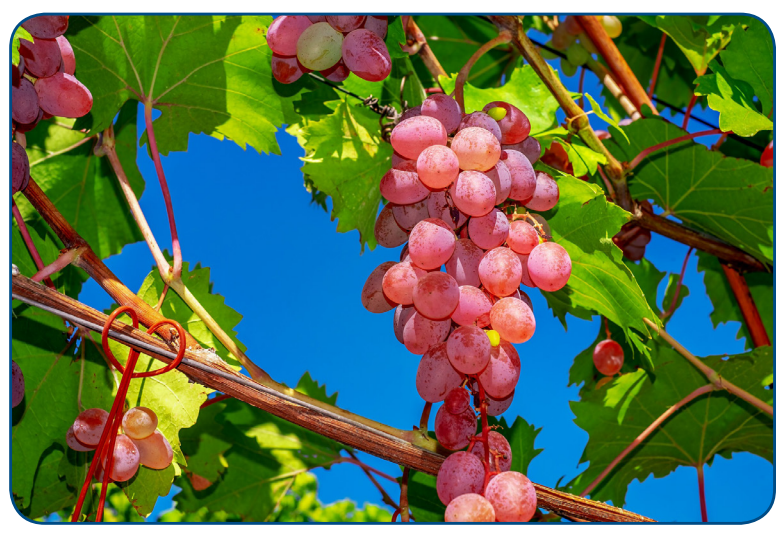
Grapes and berries are also a source of ellagic acid.

This study shows a potential new treatment to help with certain symptoms of IBD. Currently, IBD can be managed using anti-inflammatory steroids, antibiotics, immune system suppressors, or surgery for more serious cases. All available care is costly and may have chronic side effects, without treating the disease completely. The potential symptom relief by natural treatment using pomegranate metabolites gives hope for better management of IBD symptoms to the millions of people that suffer from it.