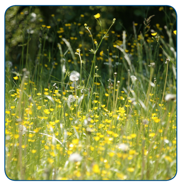
Those with oral allergy syndrome typically react to foods related to the type of pollen to which they are allergic.

When is a food allergy not a food allergy? When it's oral allergy syndrome (OAS), a type of reaction usually found in those who have a pollen allergy. Unlike traditional food allergies, the reaction is generally fairly mild and limited to the mouth. Commonly, when a person with OAS has been exposed to the allergenic food, they will experience a few minutes of irritation or swelling of the mouth and throat. These symptoms are triggered when the food comes in contact with the mouth and throat. Those with OAS typically react to foods related to the type of pollen to which they are allergic. For example, those who are allergic to grass might also have a response to orange, tomato, peach, celery, and melon.