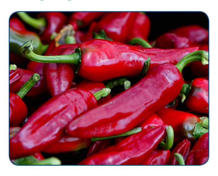
Participants with higher spice preference were more sensitive to salt, had a lower salt preference, and lower blood pressure.

Researchers from the Daping Hospital in Chongqing Shi, China conducted an observational study of 606 participants from four different cities to examine the relationship between salt preference and intake in relation to preference for spicy foods. To determine this, the researchers conducted several assessments. First, they had