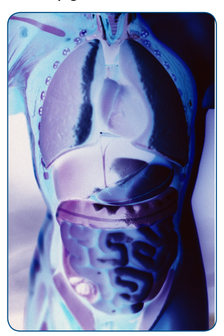
Millions worldwide suffer from Inflammatory Bowel Diseases, which causes damage to the intestines.