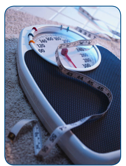
Those who consumed more sweet snacks were more likely to have more visceral and hepatic fat.

Esther van Eekelen et al. at Leiden University in the Netherlands, suggests that eating fruits and vegetables is associated with reduced hepatic and visceral fat compared to intake of sweet snacks. Previous research has shown an association between sugar-sweetened beverages and an increased risk of type 2 diabetes.