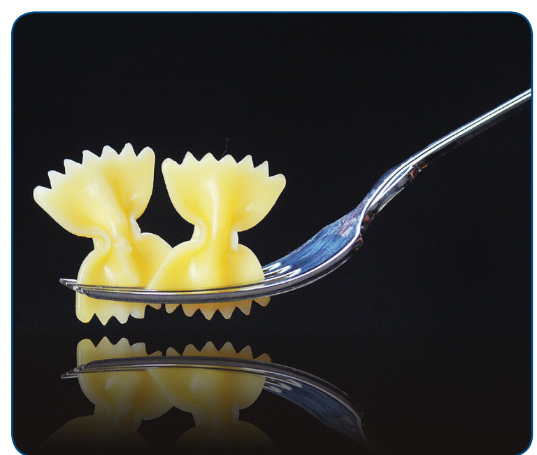
In the alternate-day fasting group, many participants that withdrew from the study cited the difficulty of adhereing to the diet as the reason for withdrawal.

caloric restriction group. However, the alternate-day fasting group had lower adherence to the diet (eating more on fast days and less on feast days than prescribed). They also had a higher rate of withdrawal from the study compared to the daily calorie restriction group (38 percent versus 29 percent). Many cited the difficulties of adhering to the alternate-day fasting regimen as the reason for