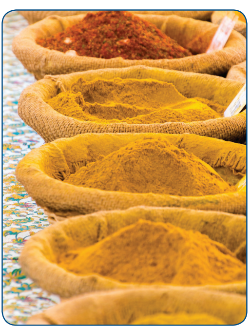
Last year, the FDA issued a recall of a brand of curry powder due to excessive lead content. The CDC also lists lead-contaminated candy imported from Mexico, toys with lead paint and folk medicines as potential sources of lead exposure.

"No matter how you look at it — protecting kids' brains, reducing the numbers of kids needing special education, increasing the number of productive workers paying taxes or increasing global competitiveness — it makes