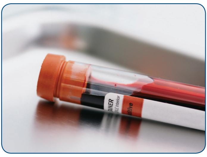
"We now know that it is not just the amount of HDL in your bloodstream that counts, but exactly what proteins and fats the particles are made of," Zivkovic said.

"We now know that it is not just the amount of HDL in your bloodstream that counts, but exactly what proteins and fats the particles are made of," Zivkovic said. The glycans attached to those proteins and fats act as keys to let the HDL particles do their job, she said.