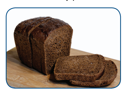
While gluten is most often associated with wheat, it also found in other grains, including rye.

In a study published in BMJ, researchers tracked 64,714