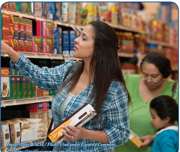
Female heads-of-households were more likely to participate in SNAP than male heads-of-households.

while residents of the Northwest were most likely to participate when compared with the East, Southeast, Midwest and Southwest. California has traditionally had lower SNAP enrollment than the rest of the nation. based on enrollment potential, possibly due to burdens associated with the application process, fear of deportation or lack of familiarity with the program.