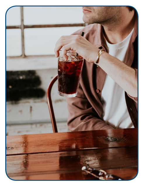
After the tax was implemented, those living in Philadelphia were less likely to drink soda or energy drinks daily, and drank soda less frequently.

also providing revenue to the city. But do they actually reduce consumption? That is the question that researchers at Drexel sought to answer in a recent study (1).