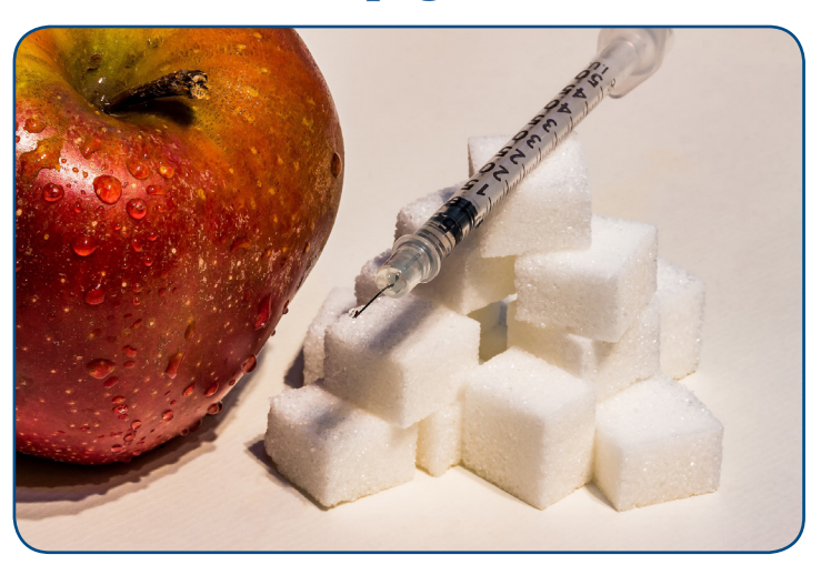
People with diabetes either do not make enough insulin (type 1 diabetes) or cannot use insulin properly (type 2 diabetes).

People with diabetes either do not make enough insulin (type 1 diabetes) or cannot use insulin properly (type 2 diabetes). When the body does not have enough insulin, or cannot use it effectively, sugar builds up in the blood. High blood sugar levels can lead to heart disease, stroke, blindness, kidney failure and amputation of toes, feet or legs. Individuals living with diabetes must regularly monitor their glucose levels as part of the management of the disease. This includes