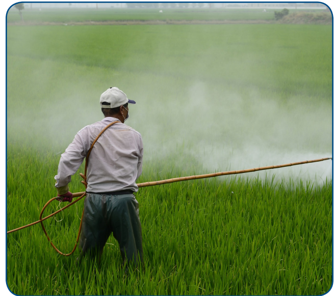
The wasted food corresponds to the yearly use of an estimated 30 million acres of land, 780 million pounds of pesticide, 1.8 billion pounds of nitrogen fertilizer and 4.2 trillion gallons of irrigated water.