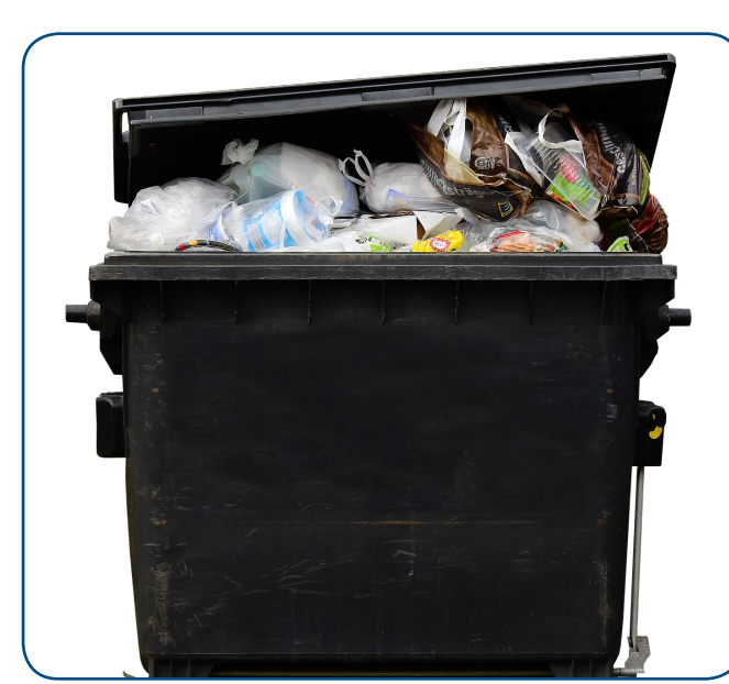
U.S. consumers waste nearly a pound of food per person per day.

Source: FDA Constituent Updates; May 7, 2018; https://www.fda.gov/Food/NewsEvents/ConstituentUpdates/ucm605524. htm