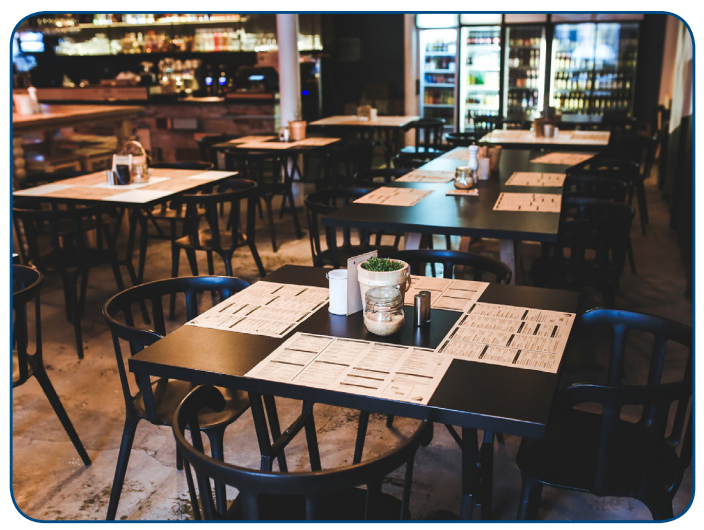
The menu labeling rule applies to restaurants and similar retail food establishments if they are part of a chain of 20 or more locations.

The Supplemental Guidance can be found at: https://www.fda.gov/ Food/GuidanceRegulation/Guidance DocumentsRegulatoryInformation/ucm583487. htm.