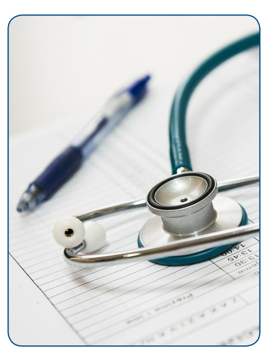
High blood sugar can lead to a myriad of health issues, including heart disease, blindness, and kidney failure.

The Eversense CGM system uses a small sensor that is implanted just under the skin by