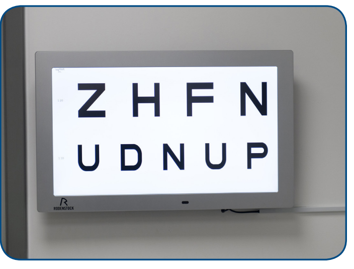
Visual acuity is a measurement of how sharp a person's vision is.

While improvements in participant visual acuity and contrast sensitivity were observed, neither