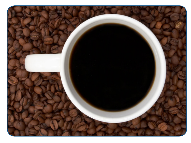
Coffee, which contains between 95 and 165 per cup, is consumed by over 90 percent U.S. adults.

For a healthy pregnancy, many women choose to follow the advice of their obstetrician and various health agencies and avoid several different foods and beverages they enjoyed before they became pregnant. Many have heard that limiting caffeine during pregnancy is recommended and cut back on their intake or abstain entirely. There are several negative health outcomes that may be linked to high caffeine consumption during pregnancy, including risk of miscarriage and low birth weight (1-4). Researchers in Norway were interested in learning whether there are additional downsides to high caffeine consumption during pregnancy—increased risk of their infant growing very quickly (known as excess growth), which may result in higher risk for