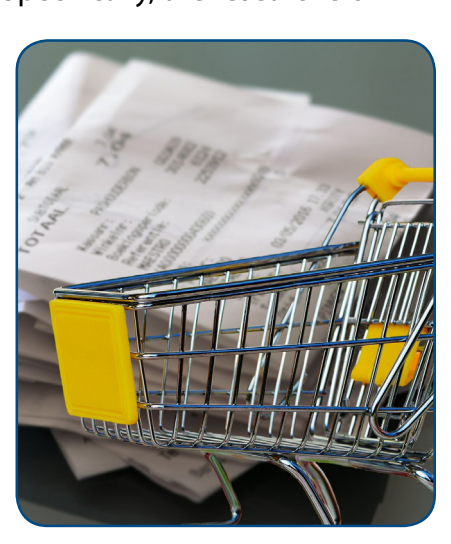
Further studies are needed to determine the kinds of foods or beverages that are being purchased instead of sugar-sweetened beverages.

These results are interesting because they show an immediate difference in people's habits following the implementation of a beverage tax. The authors did note, however, that the study took place in the winter months, and consumption patterns might be different in the summer. Further studies are also needed to determine if other types of foods and beverages are being purchased instead and what those may be.