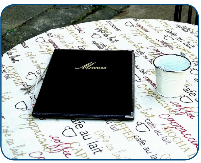
Menus are required to be labeled with the number of calories in each item, and additional must be available upon request.

The Supplemental Guidance for Industry addresses public and stakeholder comments and expands upon the draft version issued in November 2017 by providing further clarity on the FDA's practical and flexible approach to