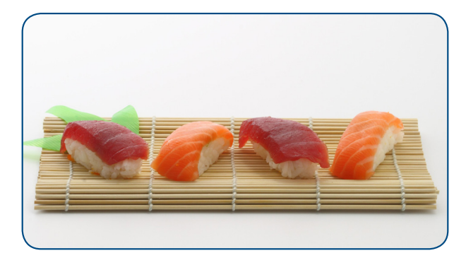
Table 1: Omega-3 fatty acid content of commonly consumed seafood

Some common seafood items with omega-3 fatty acids are salmon, tilapia, oyster, herring, and canned tuna (Table 1).