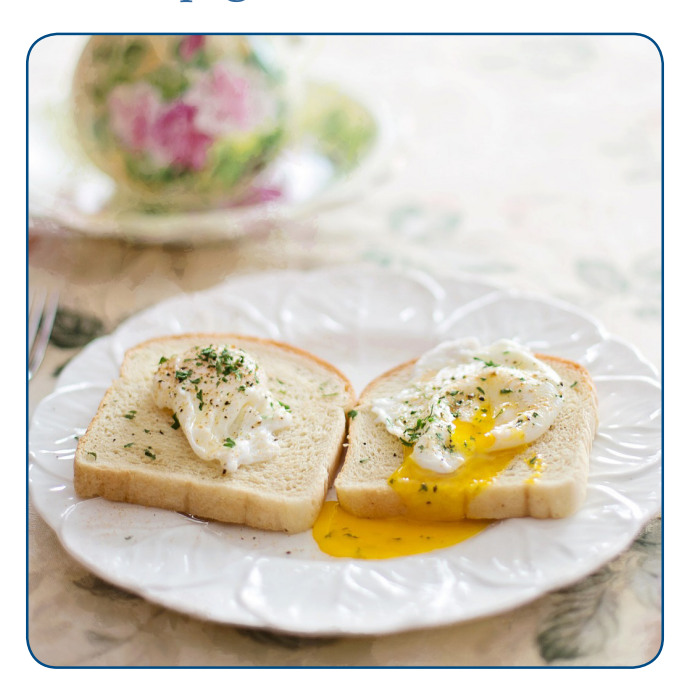
In addition to caffeine, pregnant women are advised to avoid certain types of fish that are high in mercury, raw and undercooked eggs, meat, and sefood, and foods linked to Listeria outbreaks.

Currently, pregnant women are advised to limit caffeine to less than 200 milligrams per day, which is about the amount found in about one to two cups of coffee (depending on the roast) (6). The authors concluded that their findings contribute additional support to this recommendation.