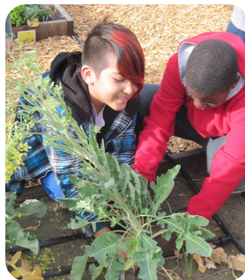
Hands-on learning in school gardens was a key component of the Shaping Healthy Choices Program.

program could be adopted nationally at little cost to schools. The program was pilot-tested for this study in schools located in Sacramento and Stanislaus counties. Study findings were reported recently during the Experimental Biology 2014 meeting.