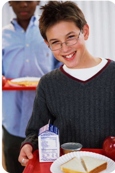
Digital imaging of lunches is method of measuring consumption using before and after photos of student trays.