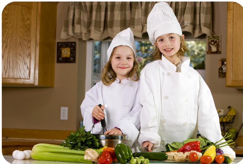
This found that children who participated in the child care-based intervention increased the amount of vegetables they ate at home.

Researchers found that children who participated in the nutrition-education program were about 39 percent more likely to drink or use low-fat/fat-free milk on their cereal than children who were not exposed to the program. The study also found a significant increase in the number of cups of vegetables that these children consumed at home each day.