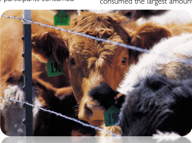
Raw milk does not undergo pasteurization, and has been linked to several food-borne illness outbreaks in recent years.

one type of milk, with the quantities increasing between days two (4 ounces of milk) and seven (24 ounces). On the first and eighth days, they consumed 16 ounces of milk and underwent breath tests days to gauge the amount of hydrogen they were exhaling. They had the option of consuming none or a smaller portion of the milk on any of the days if their symptoms became too severe. After a