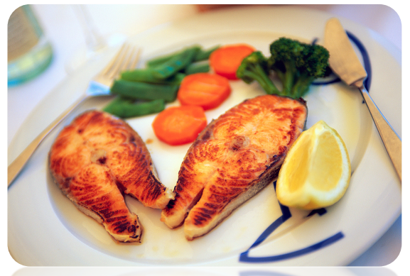
The Mediterranean diet emphasizes consumption of vegetables, fruit, legumes, whole grains, and fish.

"The potency of combining individual cardioprotective foods is substantial – and perhaps even stronger than many of the medications and procedures that have been the focus of modern cardiology," explains co-author Stephen Devries, MD, FACC, Gaples Institute for Integrative Cardiology (Deerfield, IL) and Division of Cardiology,