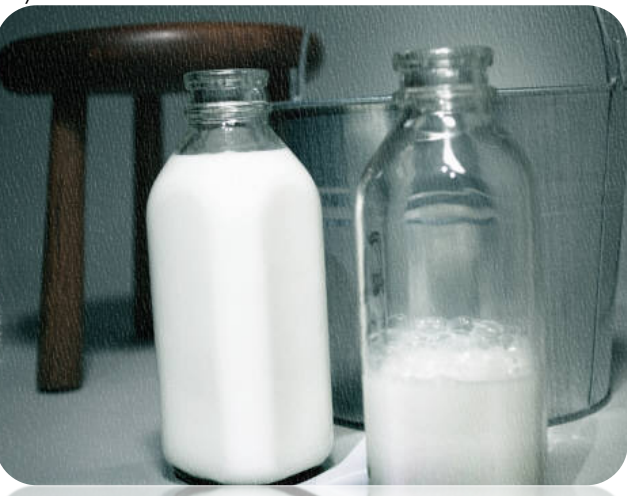
In recent years, proponents of raw milk have claimed that because raw milk is unpasteurized, it contains "good" bacteria that can increase lactose absorption.

The study was small — it involved 16 participants — but the lead investigator said the results were highly consistent