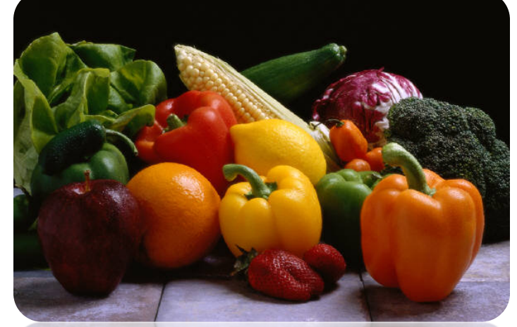
The change in dietary behavior is more likely the outcome of raising awareness about the importance of healthy eating, providing better information about food choices, and discouraging unhealthy dietary choices.

A new, extensive study from The University of North Carolina at Chapel Hill's Gillings School of Global Public Health claims that it wasn't the Great Recession or any economic downturn that created a leveling of U.S. obesity rates (with some declines in certain subpopulations), as other