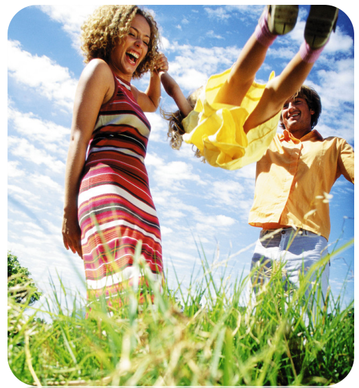
Sun exposure can provide an importance source of vitamin D by promoting the generation of vitamin D in the skin.