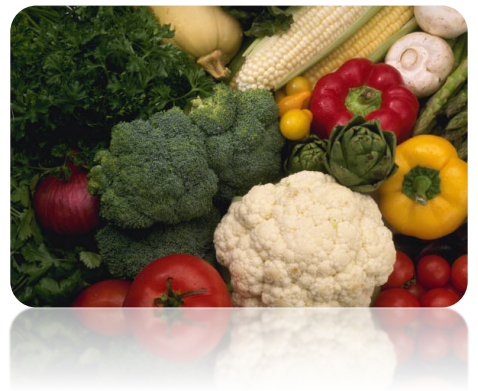
· · ·