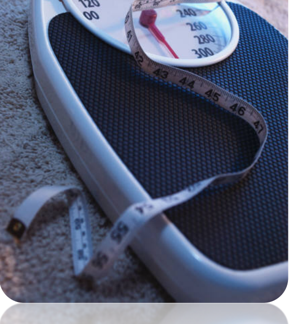
More than 50 percent of parents underestimate the weight of their overweight or obese child.

"The cases that are missed by parents are actually really unfortunate because those are the